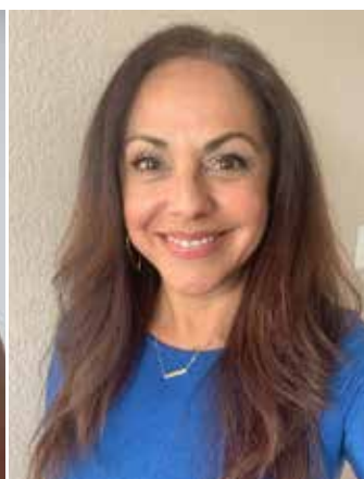
Mavel Guitron Spirit Award