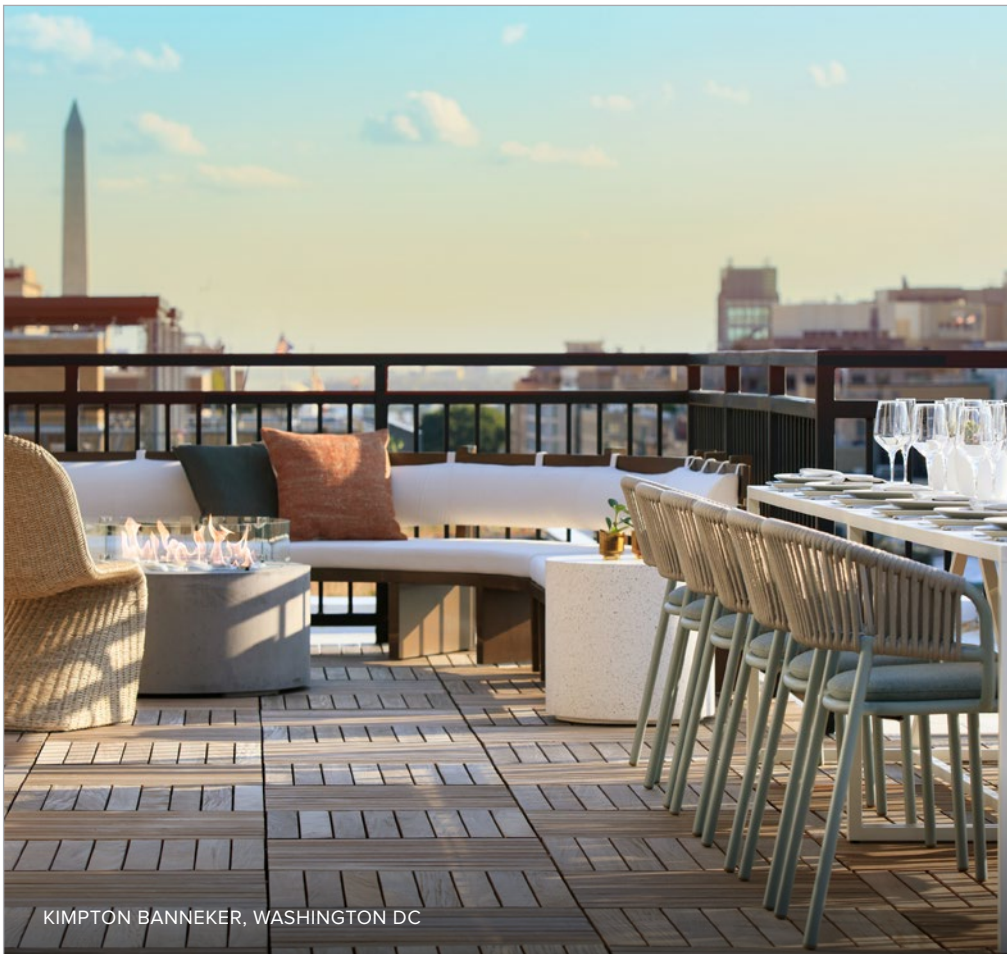
KIMPTON BANNEKER, WASHINGTON DC