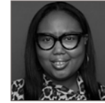
Norma Lemon-Turner Harris Health System