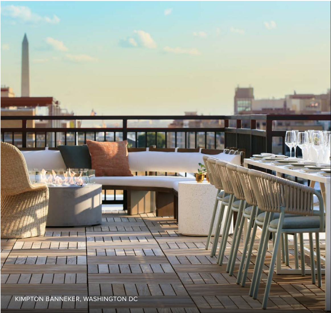
KIMPTON BANNEKER, WASHINGTON DC

FROM THE SUBTLE TO THE SPECTACULAR, WE HAVE A CREATIVE IDEA FOR EVERY EVENT.