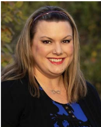
Jessica Velasco Leadership Award