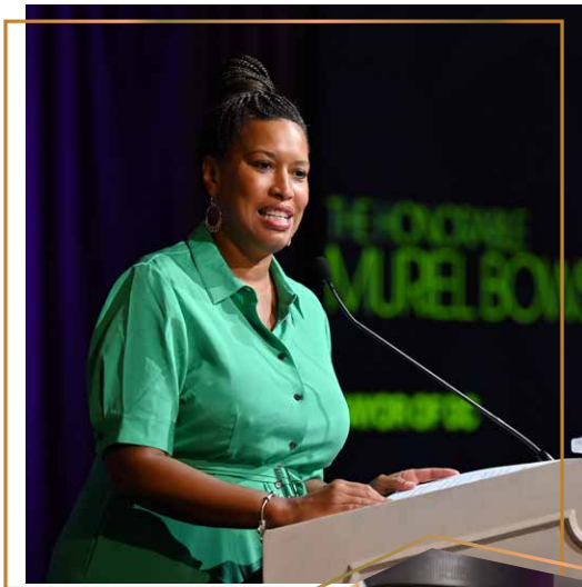
MAYOR MURIEL BOWSER, WASHINGTON DC