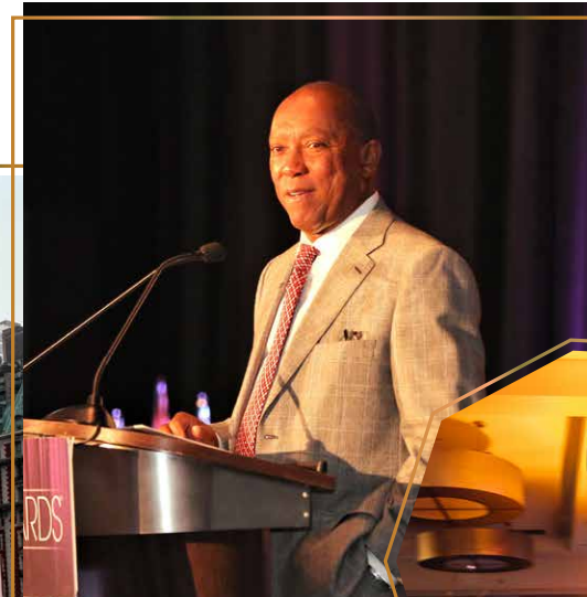
MAYOR SYLVESTER TURNER, HOUSTON