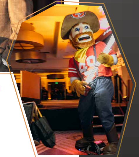
SOURDOUGH SAM OF THE SAN FRANCISCO 49'ERS MAKES A SURPRISE APPEARANCE