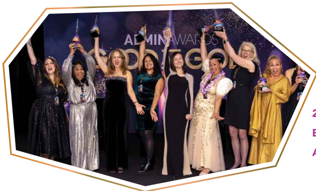
2022 SAN FRANCISCO BAY AREA ADMIN AWARDS WINNERS

Your Nominee is notified instantly that they've been nominated for an Admin Award and by whom. As you can imagine, this is an emotional and powerful moment for your Nominee – and just think, it's only the beginning!