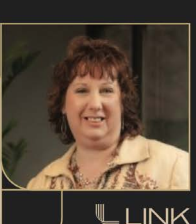
SPACE TO GROW