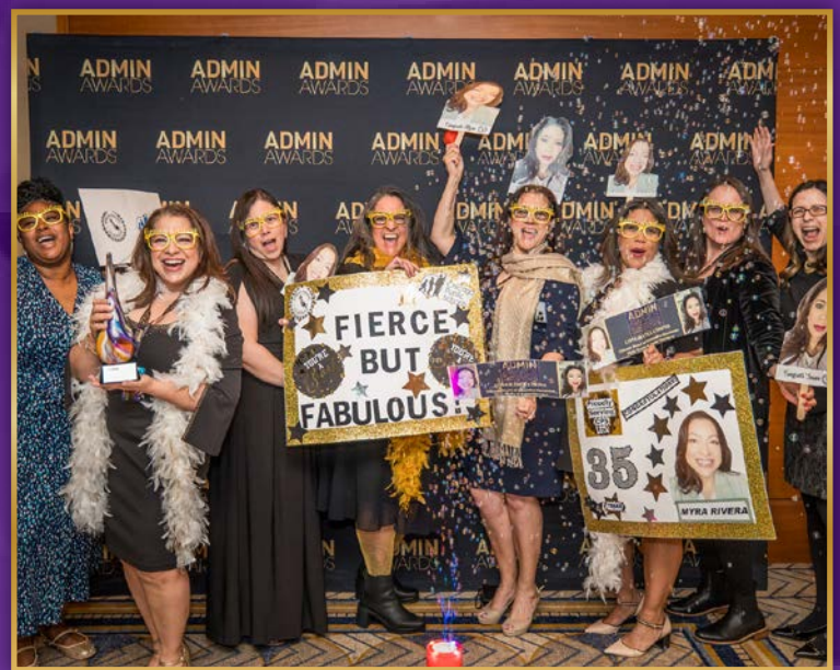
CHICAGO BOARD OF EDUCATION