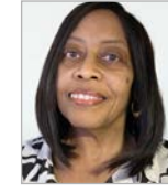
Janice Gray Crowe LLP