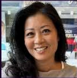
Julie Dang Leadership Award