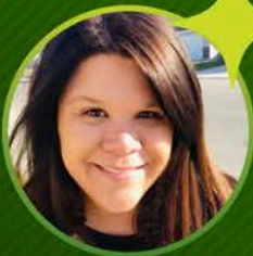
Randi Wiesner Leadership Award