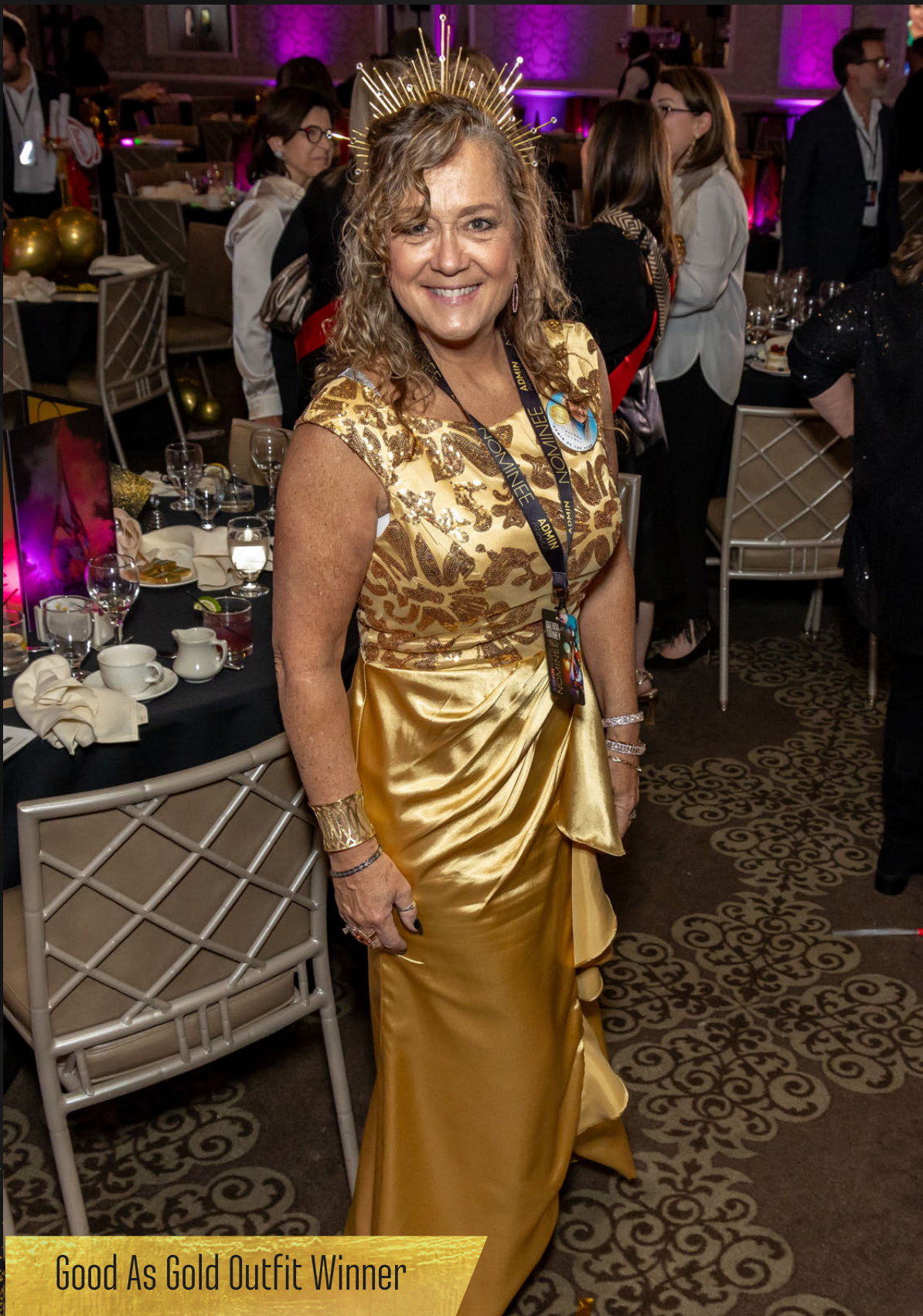
Good As Gold Outfit Winner