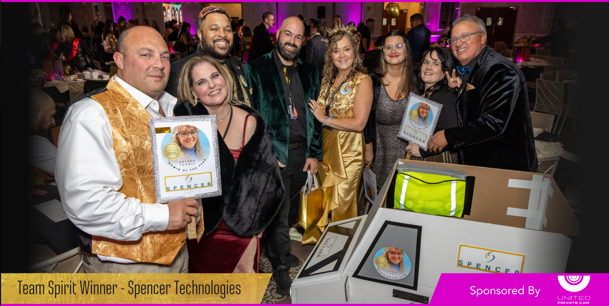
Team Spirit Winner - Spencer Technologies